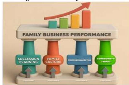
Figure 1: The Conceptual Model