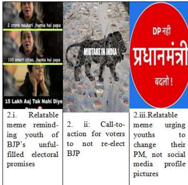
Figure 2: Thematic political memes in INC's social media profiles during 2024 general elections

Party-specific memes not only sustained online banter of citizens but also negotiated the salience of youth issues over preexisting ones. These thematic projections demonstrated vernacular nuances and youth rhetorics which is different from static traditional advertising. Online memes were equally localized, if not more than offline rallies. Such meme-based campaigns were also more cost effective than outdoor electioneering.